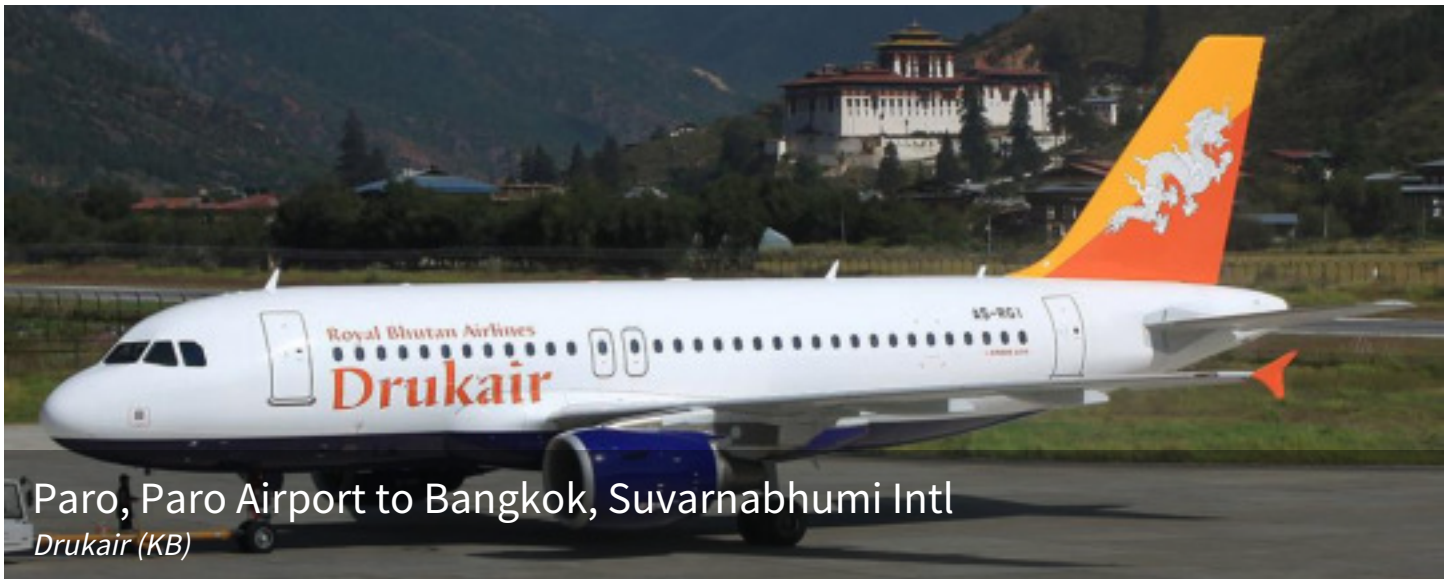
Paro, Paro Airport to Bangkok, Suvarnabhumi Intl Drukair (KB)

Early morning transfer to Paro Airport in time to check-in for your onward flight.